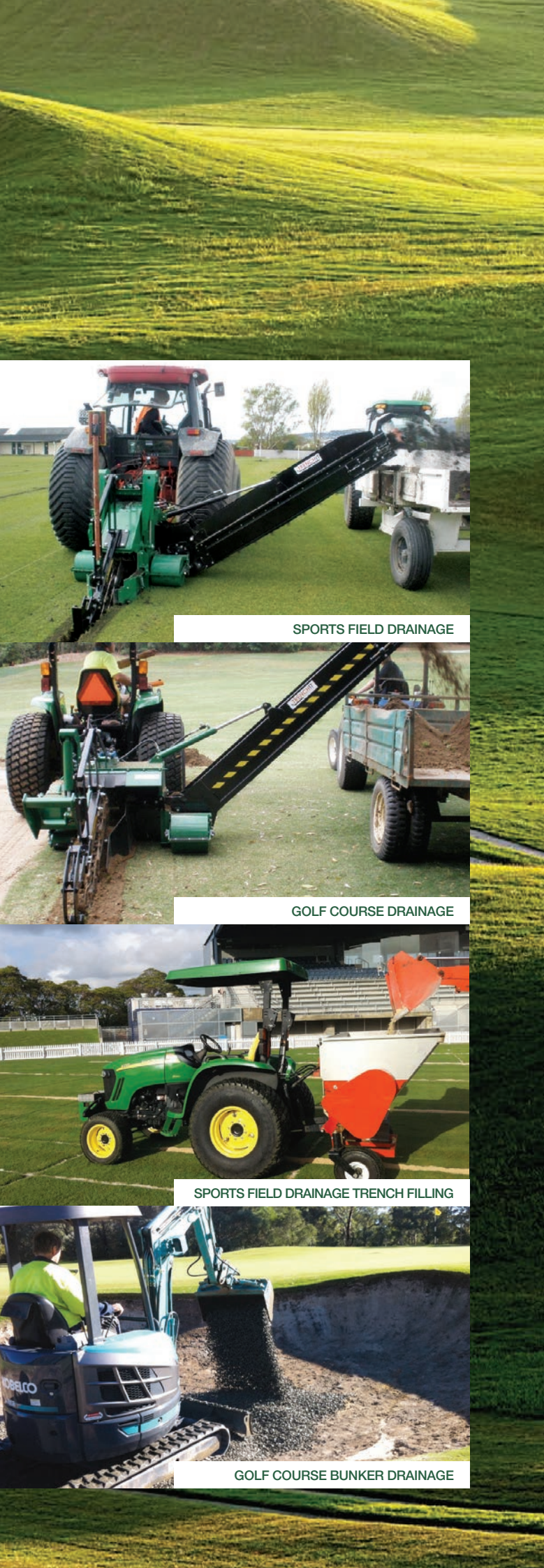
SPORTS FIELD DRAINAGE