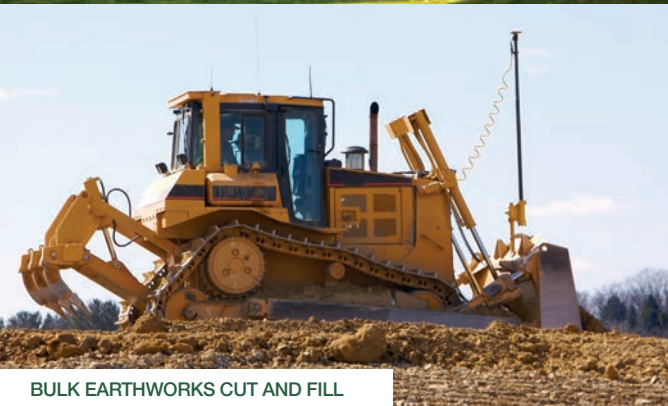
BULK EARTHWORKS CUT AND FILL