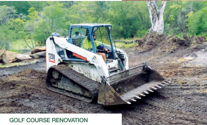
GOLF COURSE RENOVATION