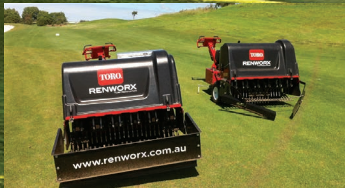
PROCORE GREENS AND TEES AERATION