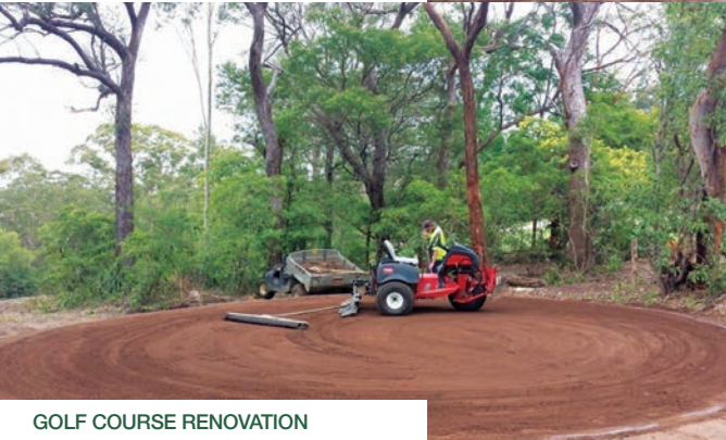
GOLF COURSE RENOVATION